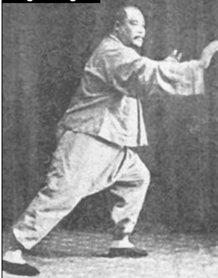
The front leg roots into the earth, the rear leg presses forwards and upwards. The legs, waist and back are one unit.

was fascinating to see how much information, and on so many levels, we were able to discern by studying and absorbing the images.